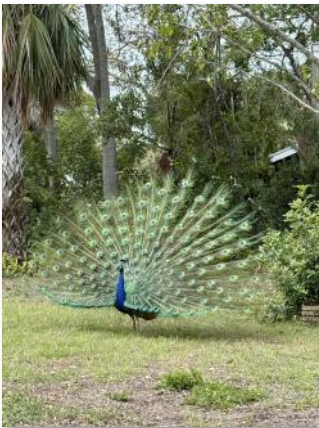
Resplendent resident of the Jungle Prada