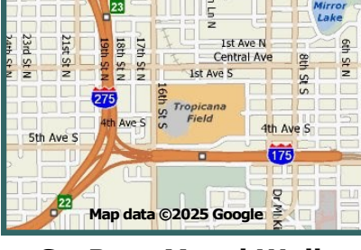
St. Pete Mural Walk <u>Special Programs:</u> PfC, RtT, StB, USA—S. <u>AVA Link</u>