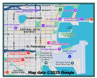
St. Pete Pier—Roser Park <u>Special Programs:</u> PFC, RtT StB, USA—S. <u>AVA Link</u>