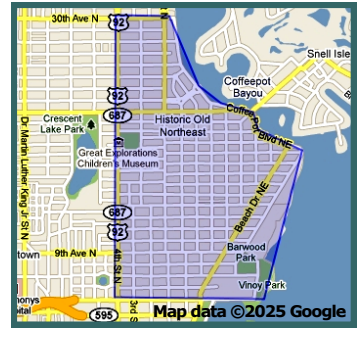
Historic NE St. Pete <u>Special Programs:</u> PfC, RtT, StB, USA—S <u>AVA Link</u>